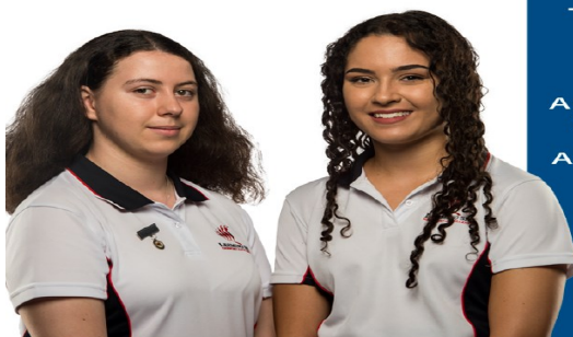
School Captains 2017

We give your child the opportunity to develop their talents.